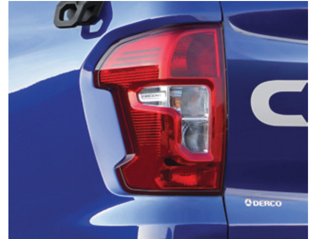
Rugged tail light design complimenting the strong look of the Hunter