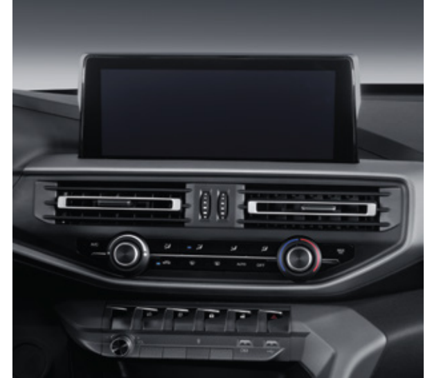
Driver focused center console with all functions right at your fingertips