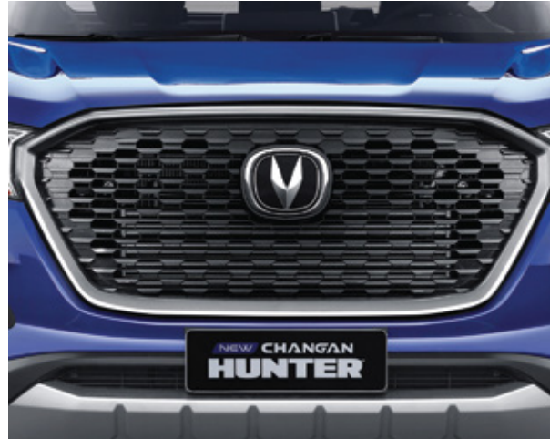
Front grille with a bold design to symbolize strength & toughness