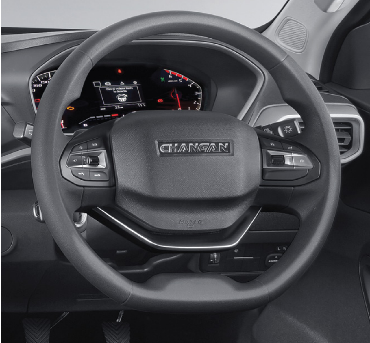
Stylish flat-bottom steering wheel with multi-function steering controls