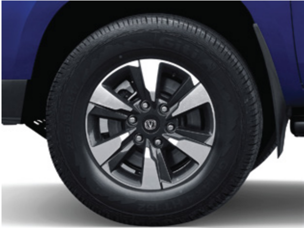
18" Alloy wheels wrapped in 265/60 tires capable of taking on the toughest road conditions