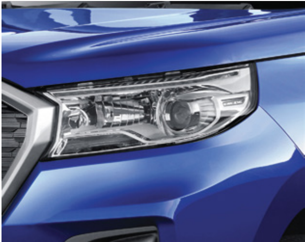
Projection headlamps for lighting up your way