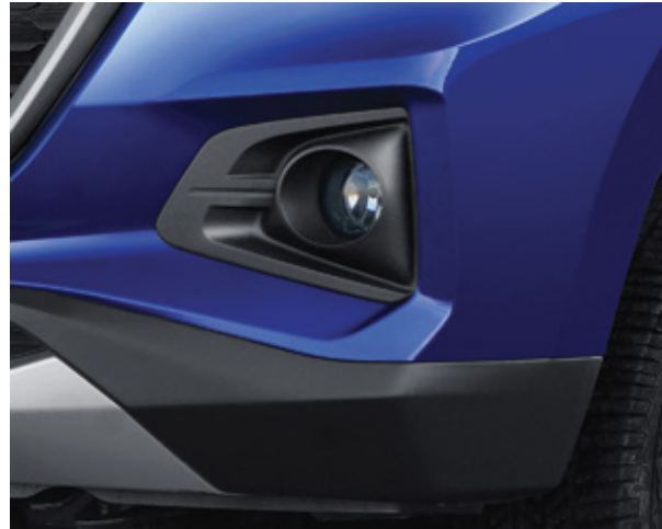
High powered fog lights for clear visibility during tough weather conditions