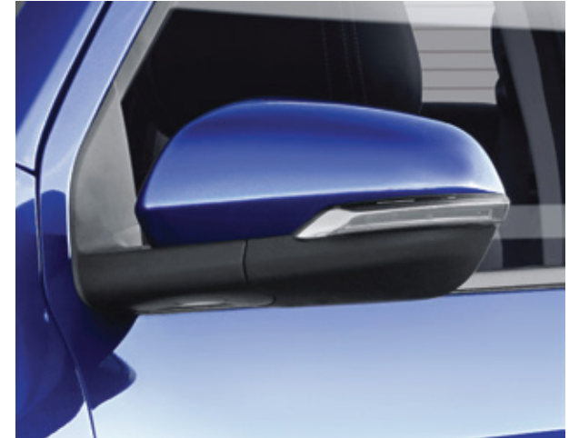
LED winker mirrors providing a clear vision on both sides while driving