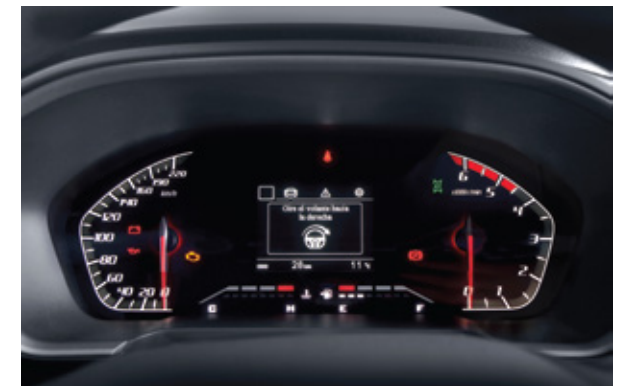
Multi-layered cluster indicating different drive modes & all necessary vehicle information