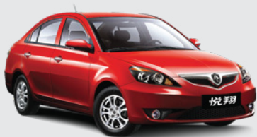
1st Generation (2009)

Changan is China's No. 1 domestic brand and has been for the last decade, year after year. Alsvin holds a strong heritage & has established itself to be the customers beloved smart sedan over generations