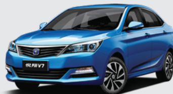
2nd Generation (2013)