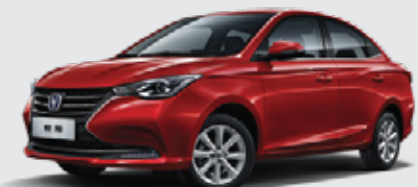
3rd Generation (2018)